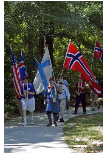
Flag bearers at the 2010 Syttende Mai celebration.

Please join us Saturday, May 14 th , as we celebrate Syttende Mai with the Friends of Scandinavia. Everyone will begin to assemble at 11:00 am in the Apex Community Park to celebrate Syttende Mai, the date that commemorates the anniversary of Norway's newly adopted constitution in 1813. There will be time for socializing and enjoying the folk music by the Spelmanslag as we organize for the parade. Then the flag bearers and fiddlers will lead everyone along the lake and back as we all join in. Keep in mind the Syttende Mai parade should include the children, so bring them all along. To add to the festivities please remember to bring your own Norwegian flags and wear your national costumes. We'll have flags for the children. If you don't have a costume, we encourage you to include the colors red, white and blue in what you choose to wear.