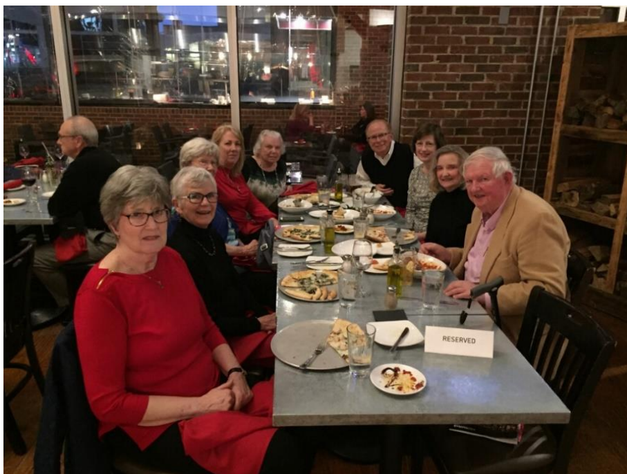
Members of Lodge 3-675